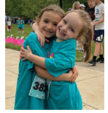
Arrow and Adler Reynolds celebrate after crossing the piglet finish line.