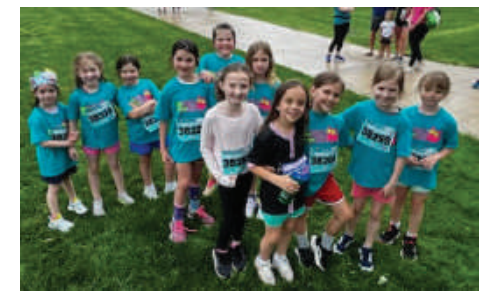
These second graders were born to run.