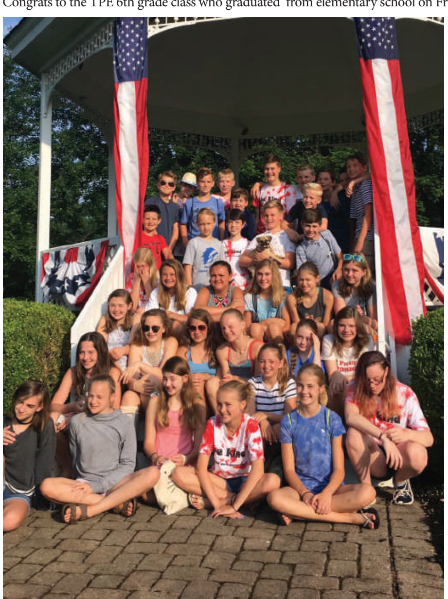
Congrats to the Class of 2024

Congrats to the TPE 6th grade class who graduated from elementary school on Friday, May 31.