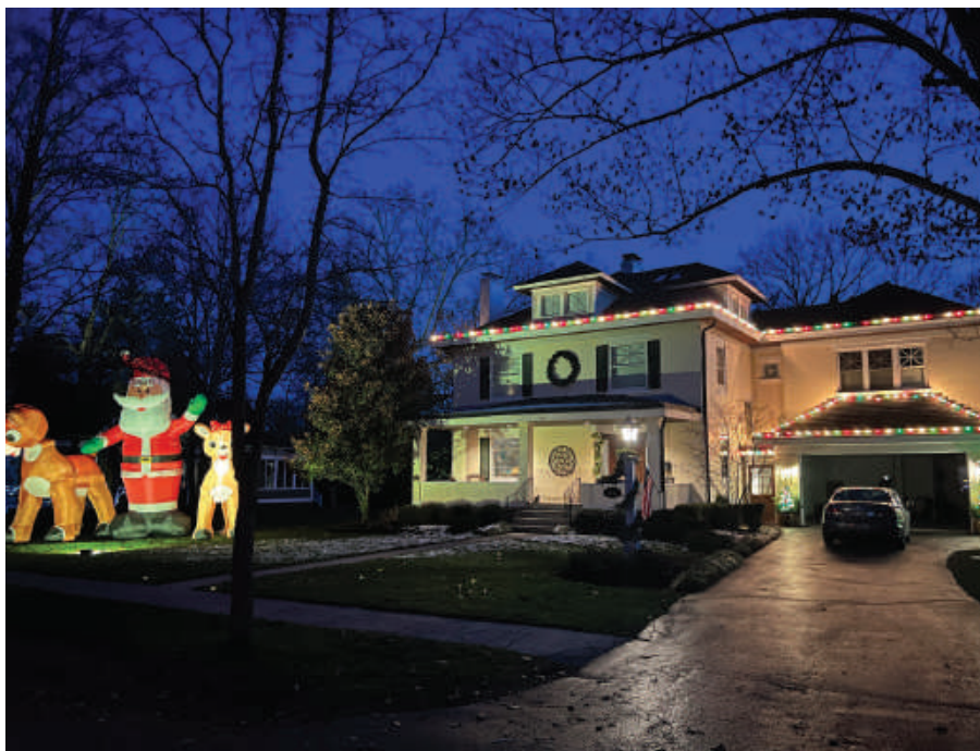
The Heis Family at 307 Oxford Avenue