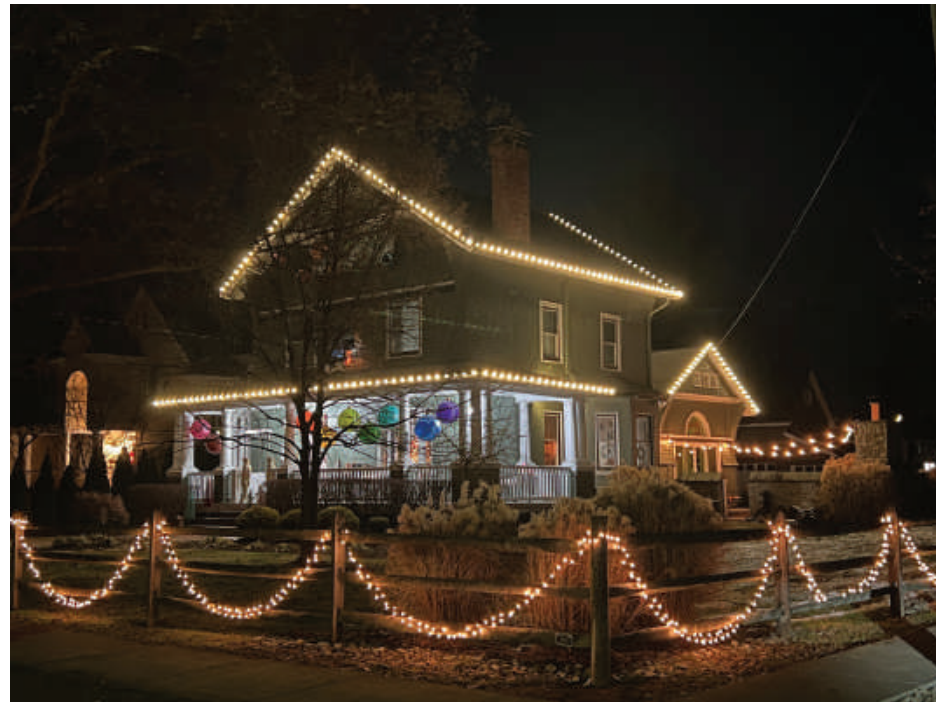
Satterwhite Family at 733 Elm Avenue