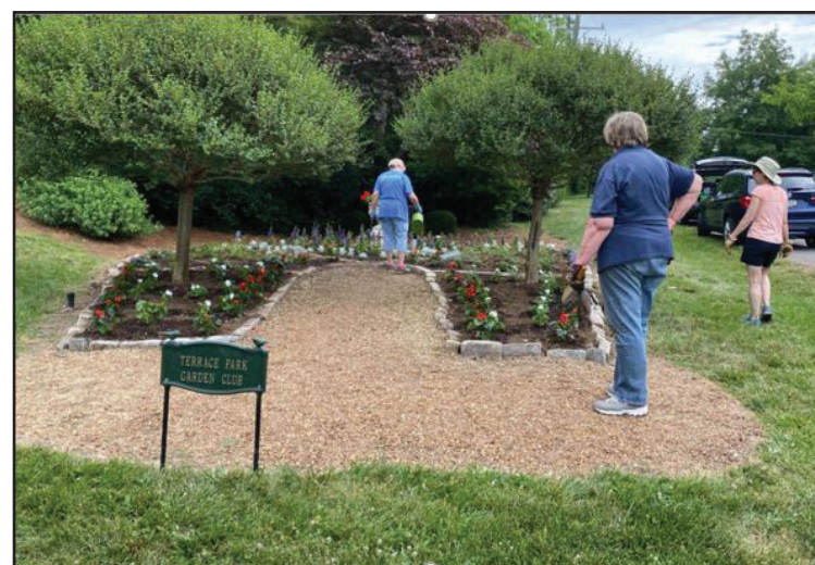
Garden Club members hard at work changing out the garden bed near the Village Green.