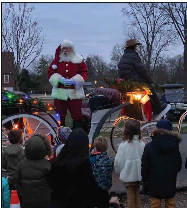
Little ones were still able to enjoy Santa during the annual Lighting of Green.