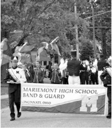
The Mariemont High School band wove through the streets of Mariemont heading toward Kusel Stadium for Homecoming 2011.