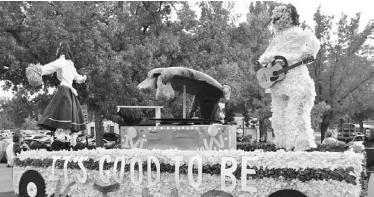
Mariemont High School's senior class won the “Decade”-themed Homecoming float competition with their Elvis-inspired entry, “It’s good to be King”.

Mariemont High School celebrated Homecoming 2011 through the “Decades.” On Friday, September 30, Mariemont High School along with alumni and community, held their annual homecoming celebration, with each current class representing a different decade.