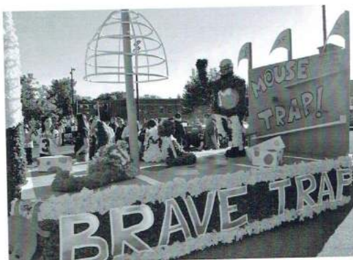
With a theme of "Board Games", the Junior Class of Mariemont High School picked the retro Mousetrap game for their "Brave Trap" Homecoming Float.