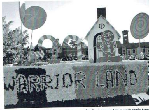
Mariemont High School's Senior Class won the float competition with their sweet Candyland-inspired creation.