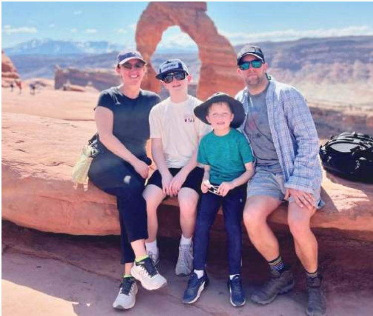
The Wattersons headed for the desert and hiked Arches National Park in Utah