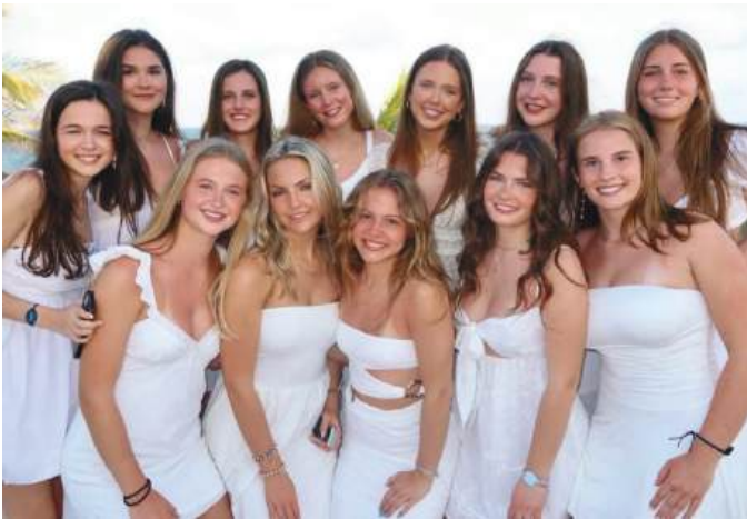
A group of senior girls made lasting memories in Cancun.