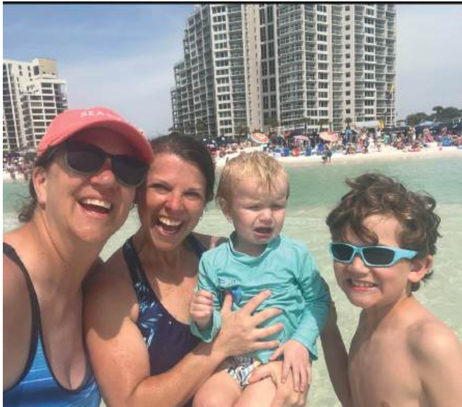
(Almost) everyone enjoyed the sun in Florida on the Zak’s vacation.