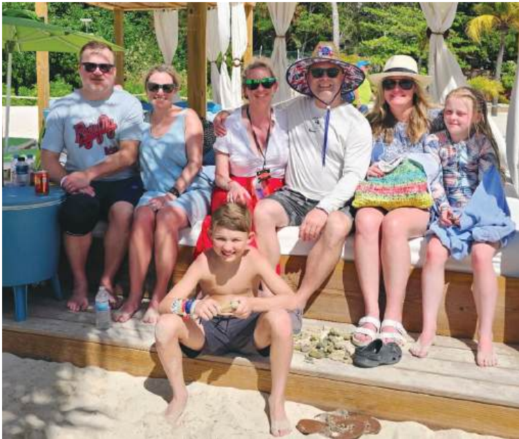
These TP families stayed shady in Haiti.

2 Times More Sales than any other Agent since 2022