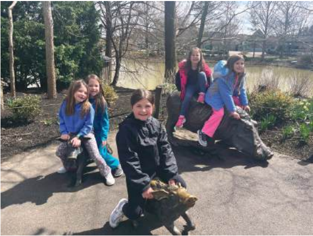
These girls were “high on the hog” enjoying fun at home during Spring Break.