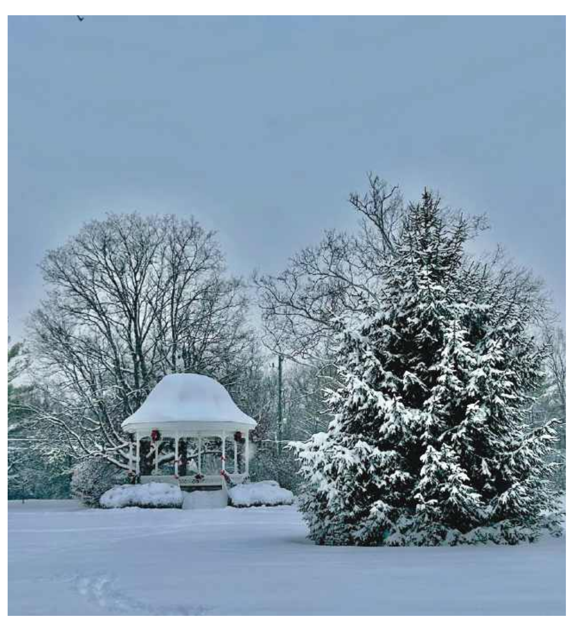
The Village Green was a winter wonderland.