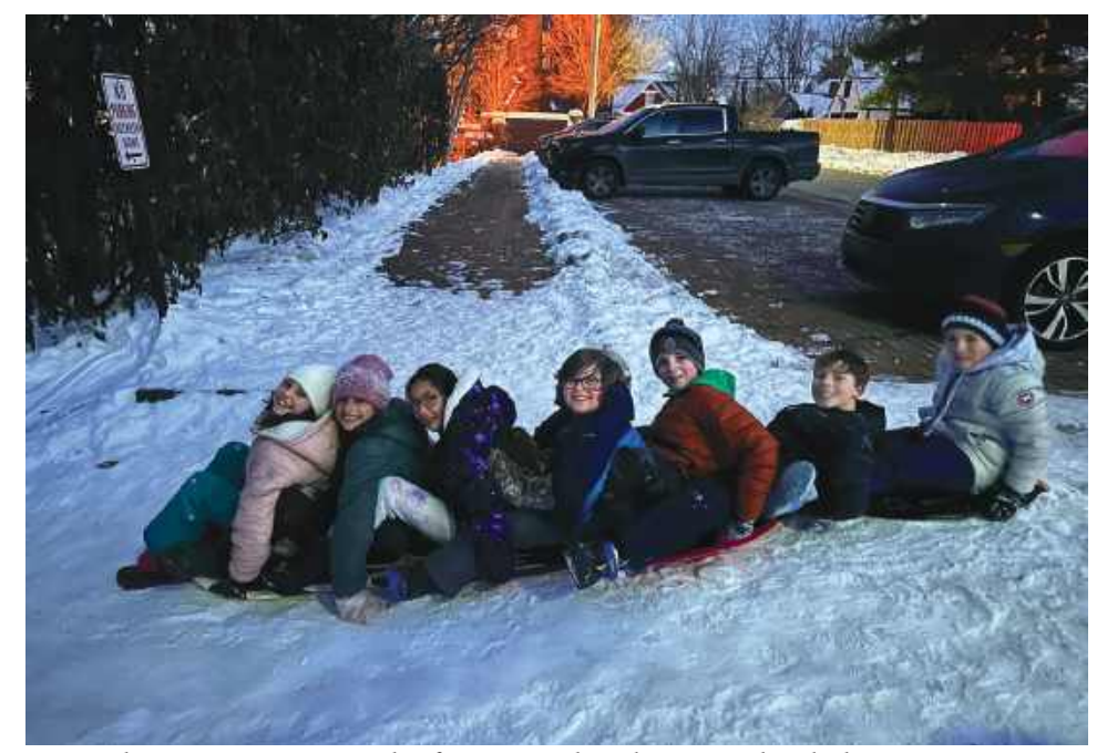
Students at TPE enjpyed a few snow days last month! Sledding was a popular snow activity.