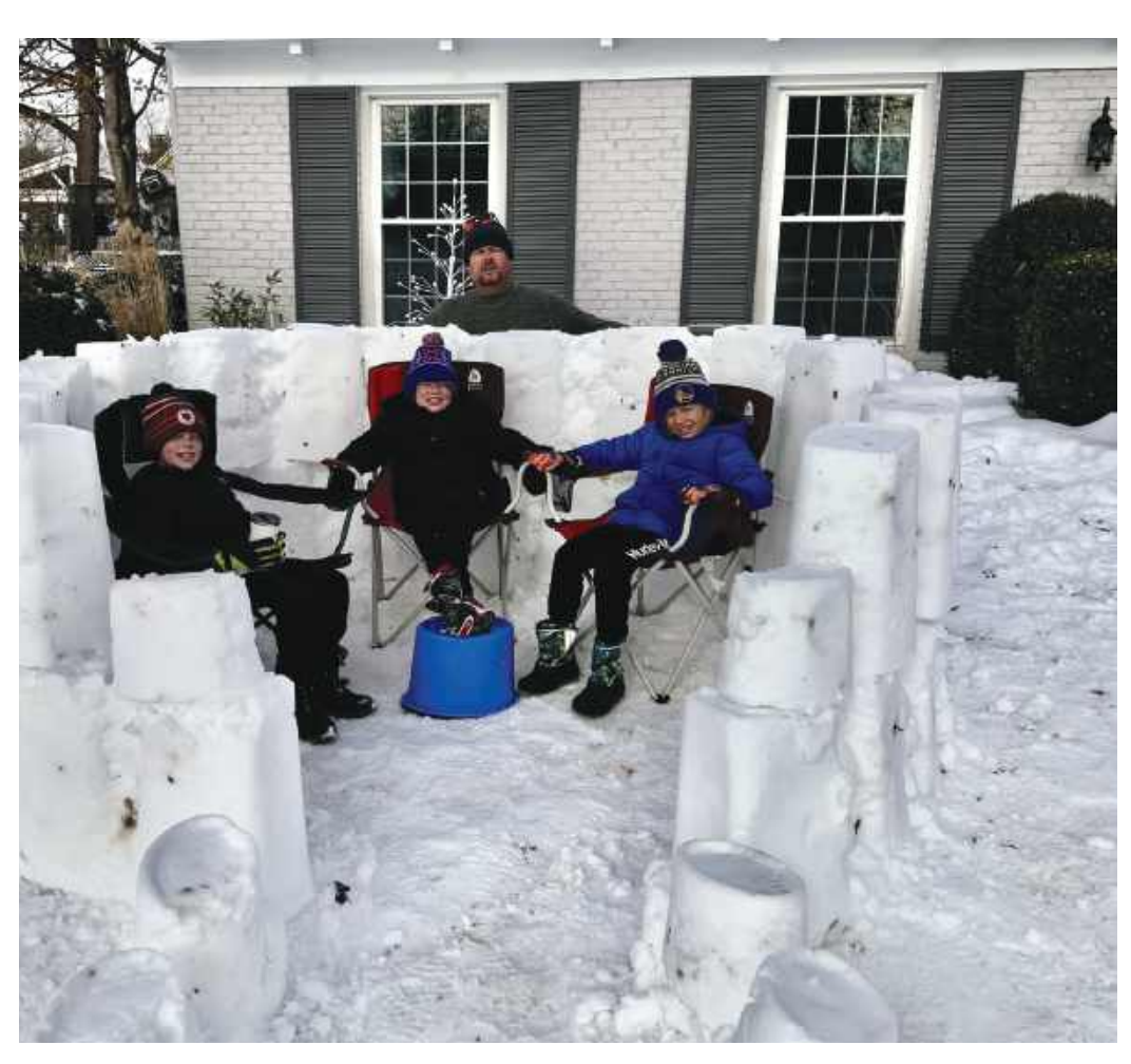
The Kramers were safe from snowball attack behind the high walls of Fort Marietta.