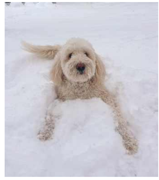
Willis Schumacher enjoyed flockling in the snow!