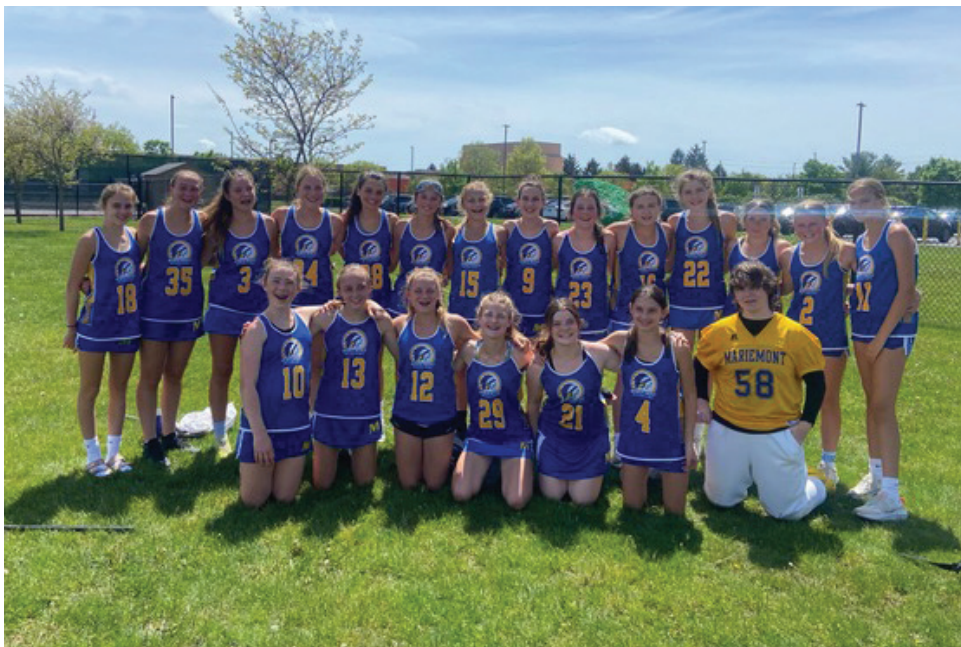
Girls MJHS Lacrosse went undefeated in the regular season and finished 3rd at the state tournament! Boys MS School went 8-3-1 in the regular season and are ranked in the top #10 of the state as they head into the tournament. The future looks bright for MHS LAX.