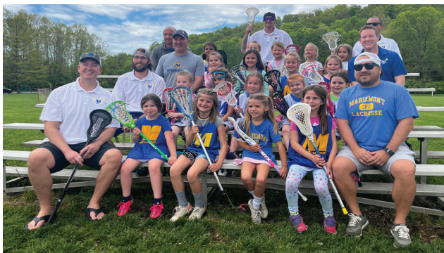
Mariemont Girls Kindergarten Lacrosse