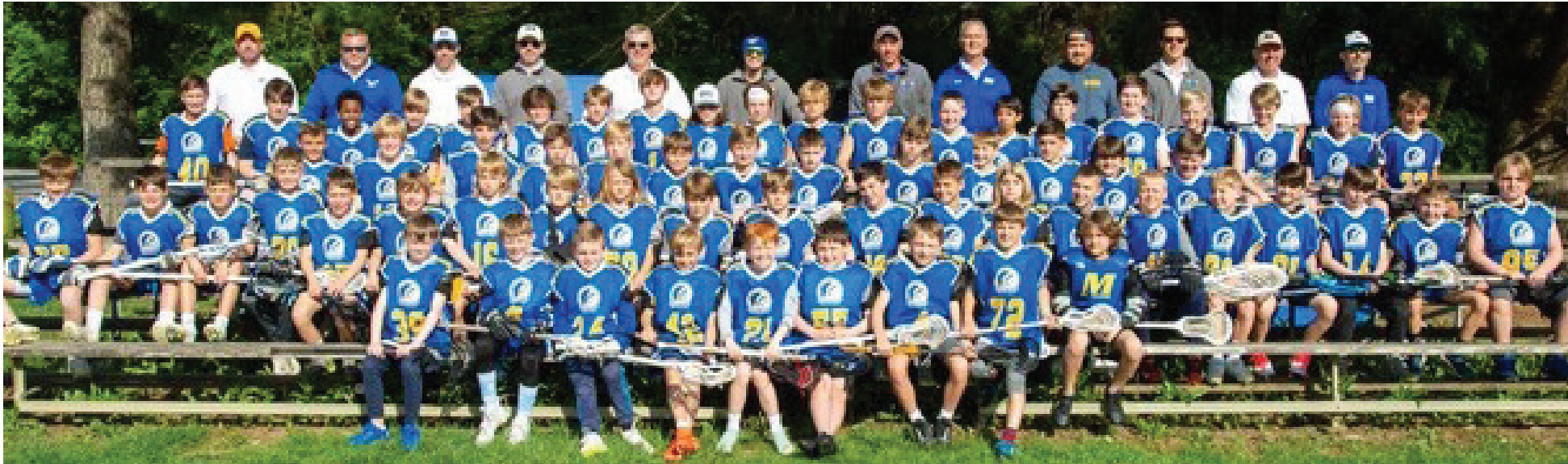
Mariemont 3rd-6th grade Lacrosse