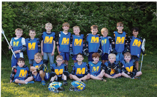
Mariemont Boys Kindergarten Lacrosse