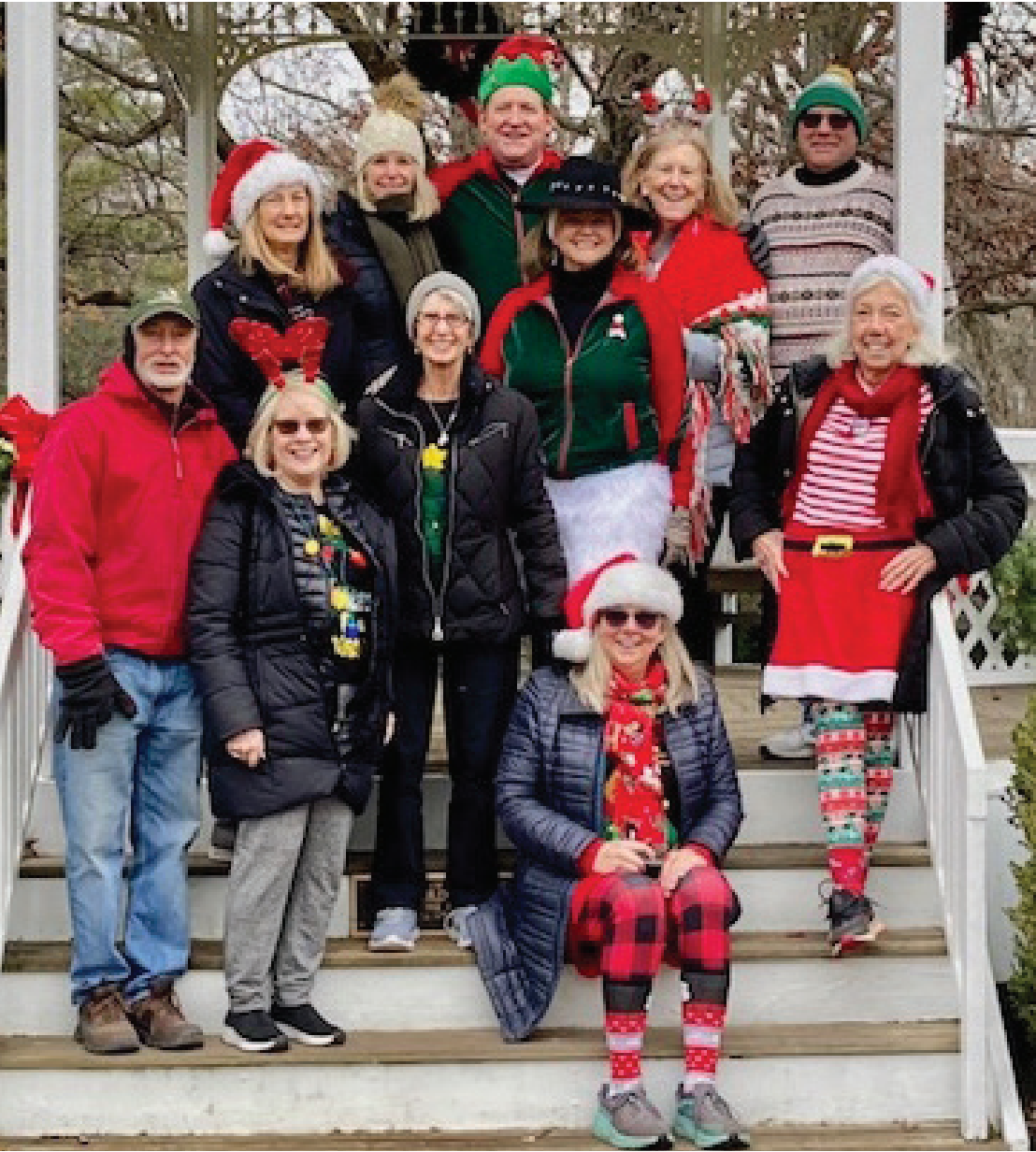
Did you know that a bunch of your neighbors have been in a TP Walking Group for over 15 years? Here is just a portion of the gang, gathered together on the gazebo steps in December, and decked out in their holiday swag. Long-time friendships and fun with neighbors are hallmarks of village life here in Terrace Park.