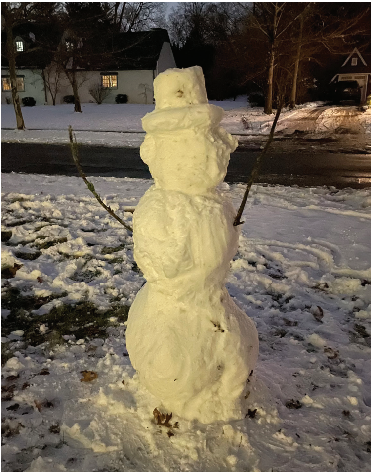
The Eckert family decided to make Fosty the Snowman before the snow melted last month!