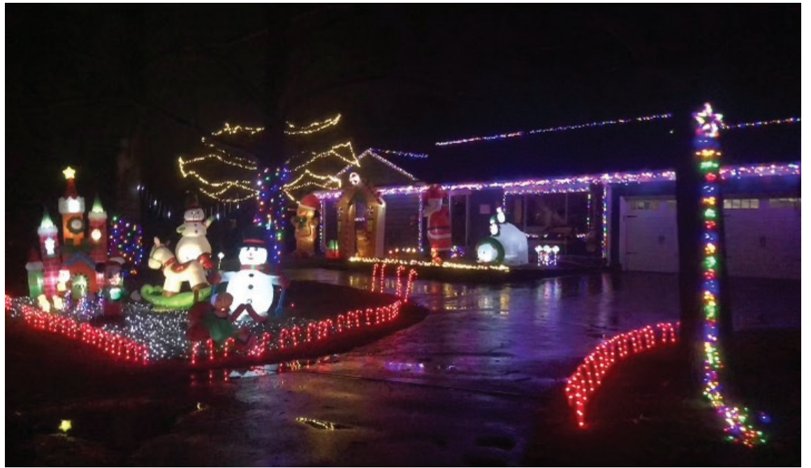
Congrats to the Clark W. Griswold award winning house located at 822 Myrtle Avenue.