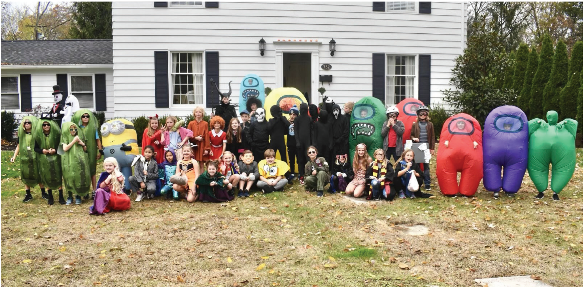
The Terrace Park Elementary fourth grade class posed for a class photo before heading back to school on Halloween. It is a traditon for students to leave school during lunch to get dressed for the annual parade and party.