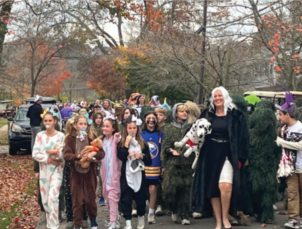
“Croll”-ella de Nice led the group of Terrace Park Elementary students during the annual Halloween parade.