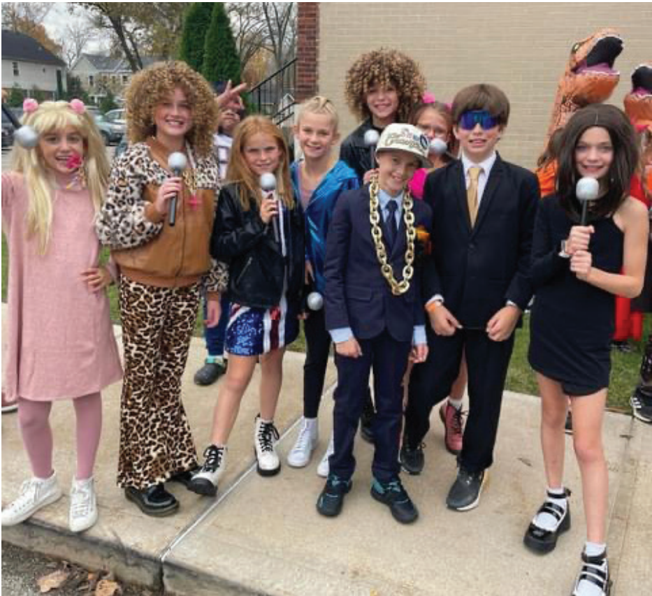
Terrace Park was lucky to be entertained by the Spice Girls and their managers this Halloween!