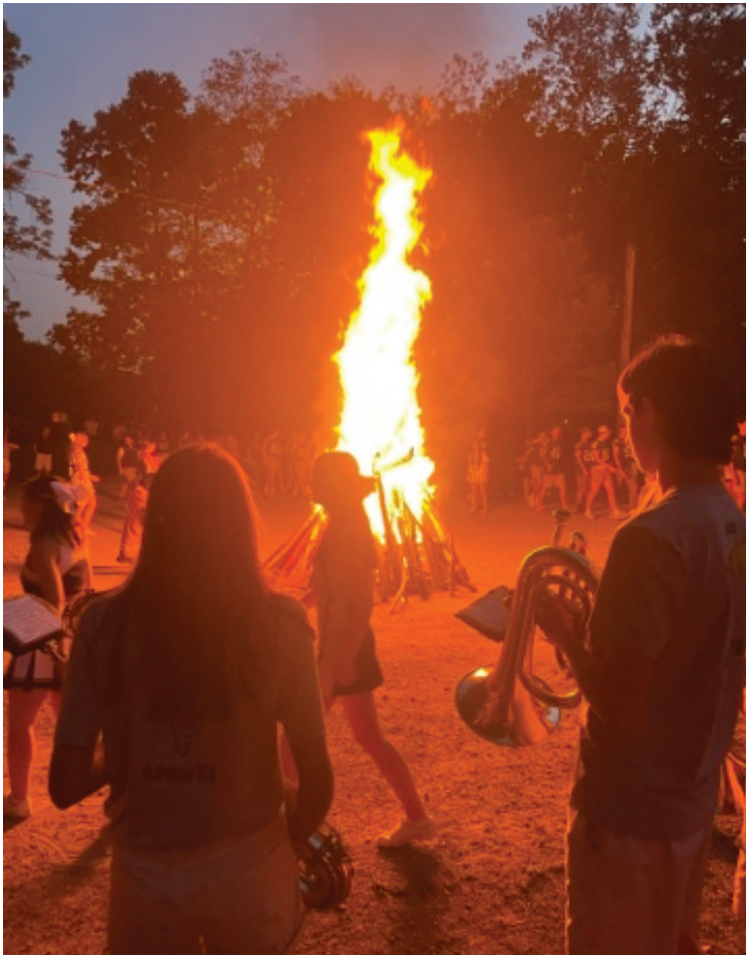
It was a perfect night for the annual Mariemont High School Pow-Wow to kick off the Warriors vs. Indian Hill Braves yearly football game.