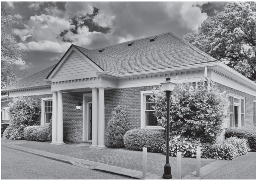
So Many Possibilities!