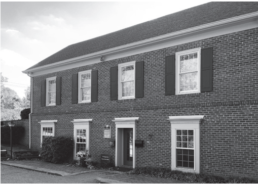
2 Office Suites Available