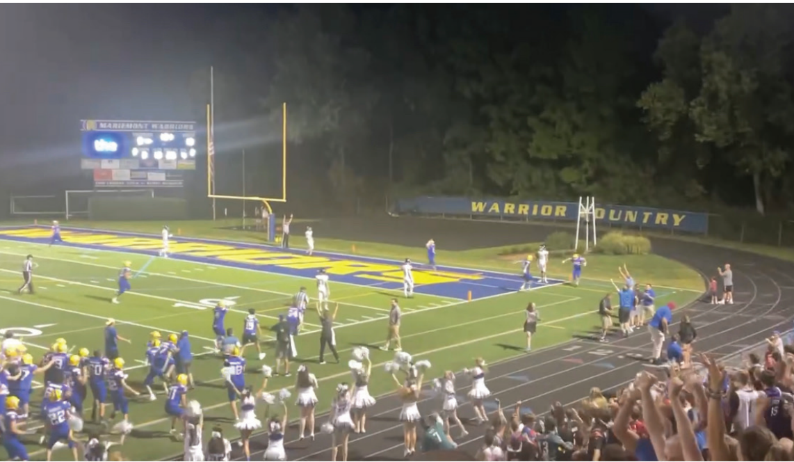
The Mariemont Warriors Varsity football team had a fourth-quarter comeback against the Indian Hill Braves last month. The last time the Warriors beat the Braves was in 2014!