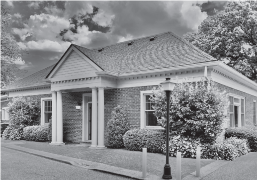
So Many Possibilities!