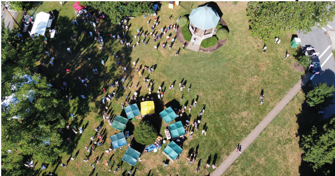
The Village Views received both of these bird's eye views from a neighbor's drone. One shows the return of our Labor Day festival and the other captures the light of the annual bonfire at the Log Cabin before the varsity football game against Indian Hill. The Village Views welcomes all photo submissions of life in Terrace Park!