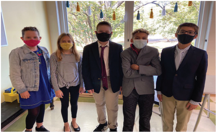
left: Some sixth graders have to loosen the tie after a long day of studying

that's my opinion. If you want to wear a mask then you can wear a mask, it's your choice. You don't have to trick or treat because you may not with COVID-19 going around. I love going to the house where Stanton and Miami collide. They make a haunted house in their driveway, they scare you and then give you candy. Halloween is shaping to be a great day!