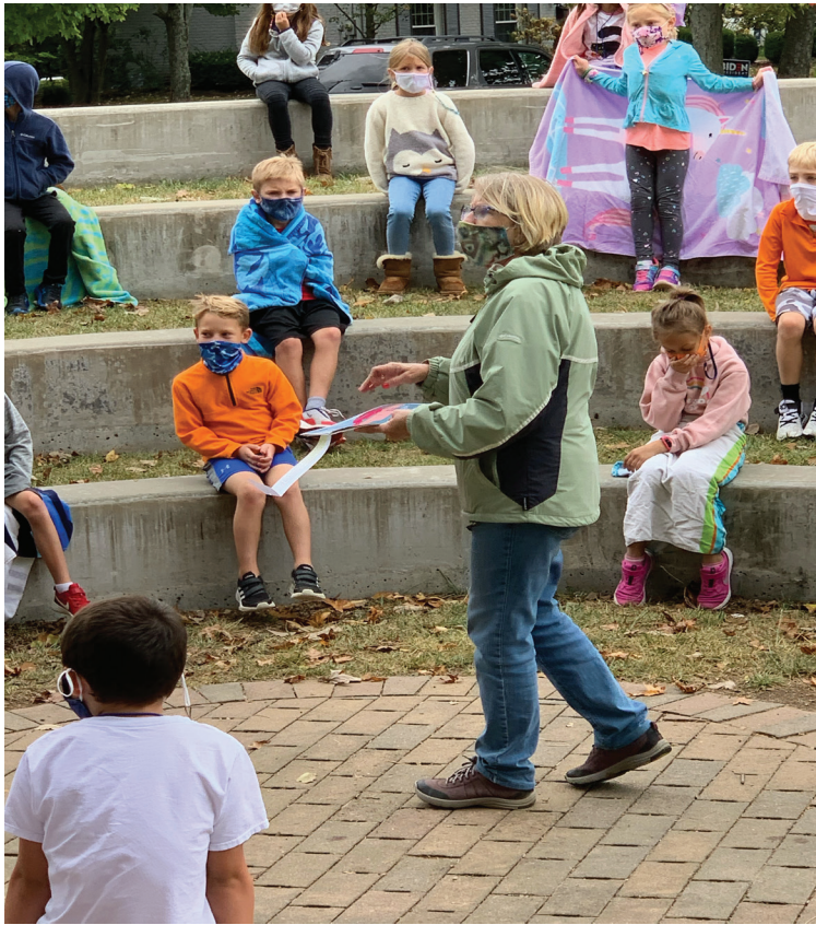
Students listen to the presentation at Arbor Day 2020