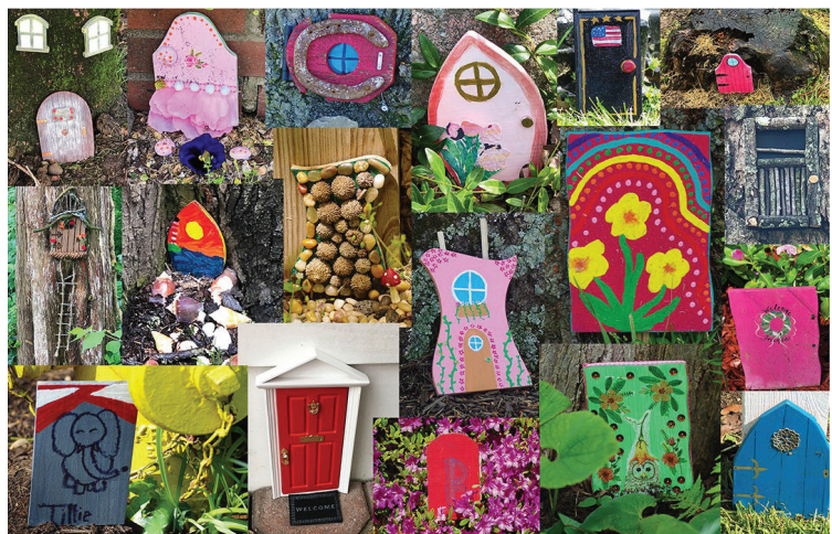
198 pc. puzzle (above) and 99 pc. puzzle (below)

To order any puzzle, call or text Marcia Moyer at 680-4322.