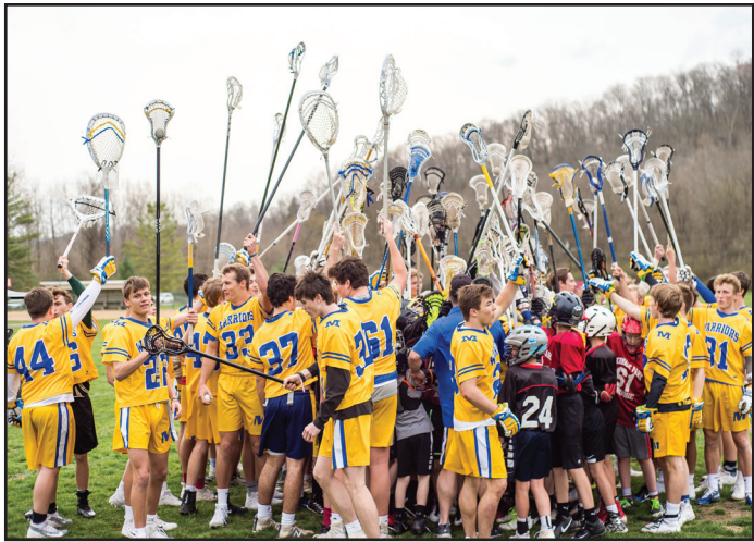
The Mariemont Lacrosse Team spent a practice on Drackett field with the youth Bulldog lacrosse teams last Spring.