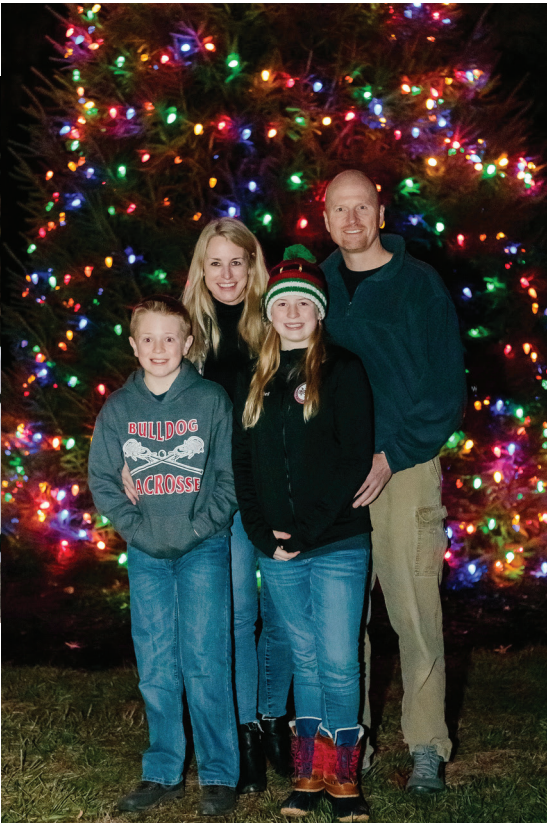
The Center family won the honor of lighting the Village Green Christmas tree!