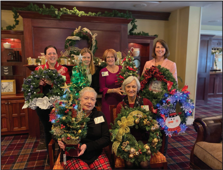
The winning holiday creations from the Garden Club.