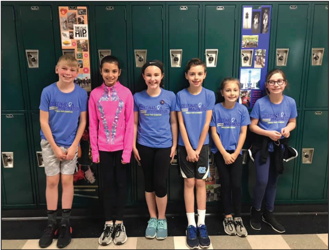
The Hurricane Helpers dominated at Destination Imagination in May placing 7th at Globals.