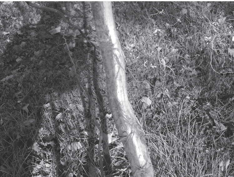
A young tree damaged by a local buck. Protective cages help to ensure a forested village for the future.

ist noticed five tree protectors were missing and three of the trees were already badly damaged. These protective cages were replaced and will be removed when appropriate. If you have a question, please call the Village Arborist at 513-675-0024.