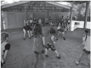
Sixth graders making new friends at Camp Kern

Thinking about a vacation in the Rocky Mts. close to Rocky Mt. N.P., Winter Park, hiking & biking trails, wineries & breweries?