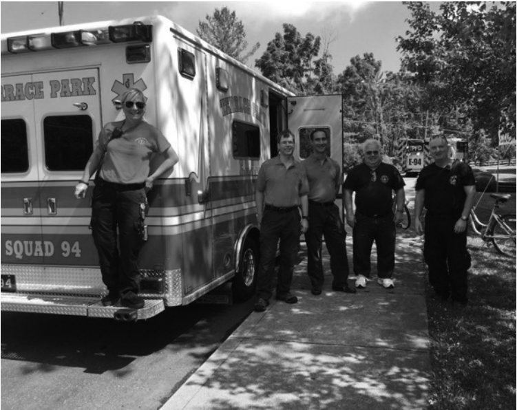
The EMS Crew