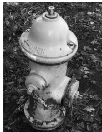
One of the many TP fire hydrants that were in need of refurbishing

the fire hydrants with several coats of bright safety yellow. In addition, they checked the fire hydrants for damage in order to report any safety hazards to the village. Now the refurbished fire hydrants are more visible and look better, adding to the safety and beauty of Terrace Park. Thanks to Chief Hayhow of the Terrace Park police for providing information on the fire hydrants that needed to be refurbished, Schuloff tool rental for providing discounted tools, and Home Depot for providing discounted supplies. Special thanks to fellow Scouts and parents for assisting Jeremiah to