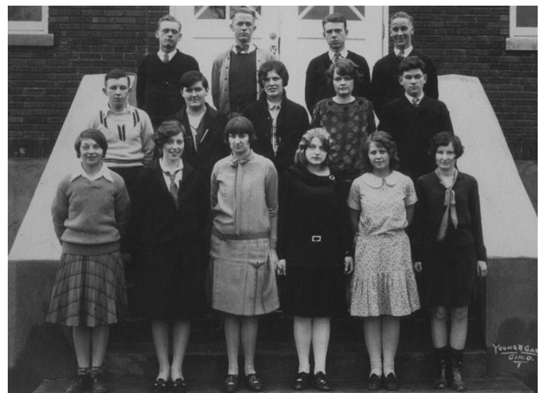
Terrace Park class of 1929