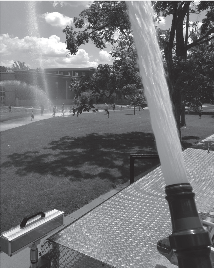
Hmmmm.....looks like the Fire Department had an advantage at the water fight over the Memorial Day weekend!