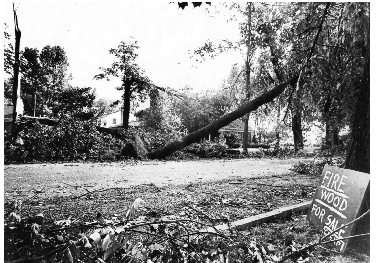
From the Archives: Tornado of 1969 Yes, many years ago, a tornado actually struck our village. According to the Cincinnati Enquirer, "uprooted trees and broken branches covered the streets of Terrace Park after the August 1969 tornado".

The program will be held at the Terrace Park Elementary School library on Sunday, March 2, 2014. There will be a reception at 3:30 p.m. followed by the program at 4 p.m.