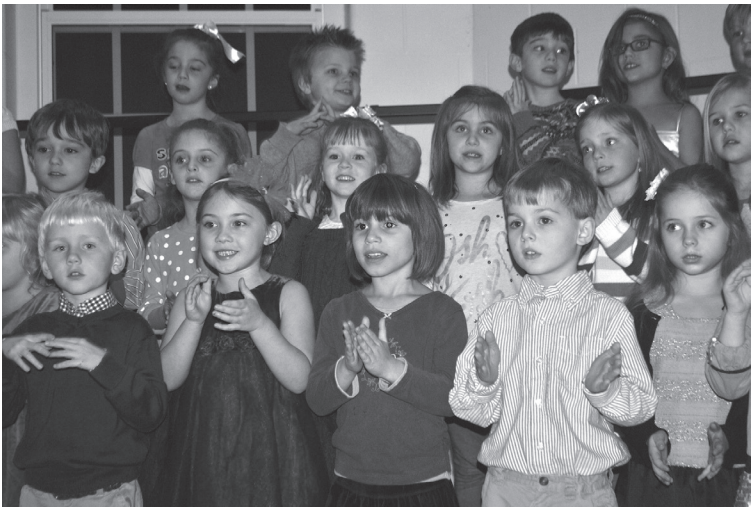
Kindergarten students sing “Wheels on the Bus” at Mariemont City School’s State of the Schools address

The “It’s About ME” video is available on the district’s website, www.mariemontschools.org. The address also contained perfor- mances by the kindergarten class as well as the Mariemont High School chamber ensemble.