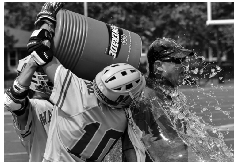
Best shower ever