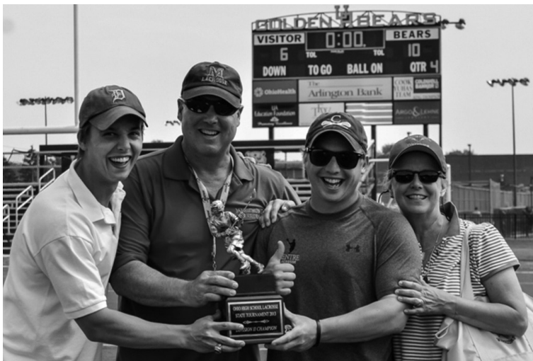
The First Family