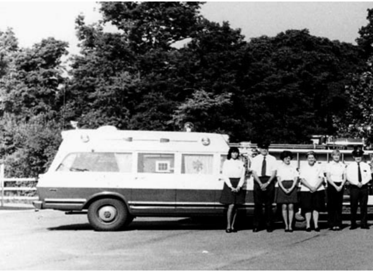
Terrace Park Life Squadmen in the 1970s.