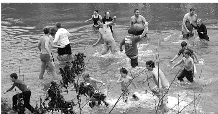
Residents brave the cold water of the Little Miami at the first New Year's Day Polar Bear Plunge.