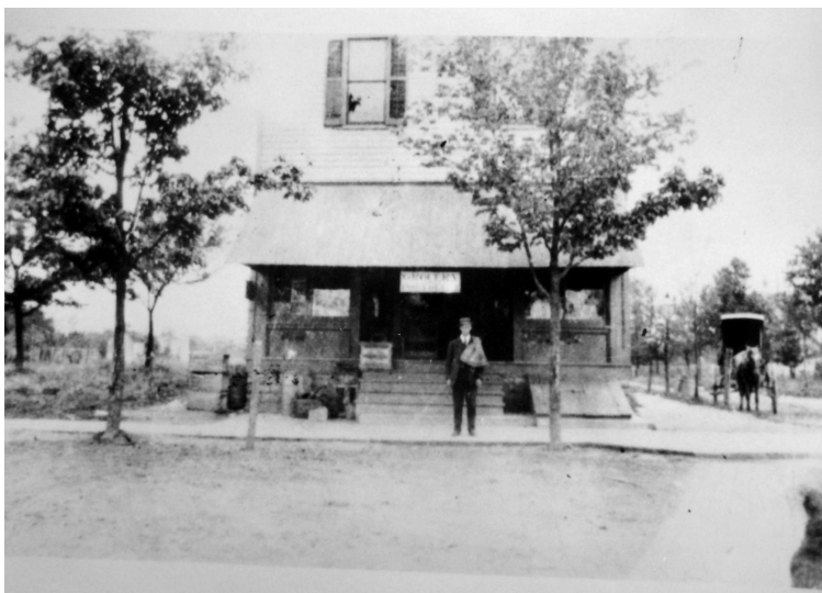
The Terrace Market was constructed in the 1880s and was a store until 1980, when it became the offices of Kennedy Associates.