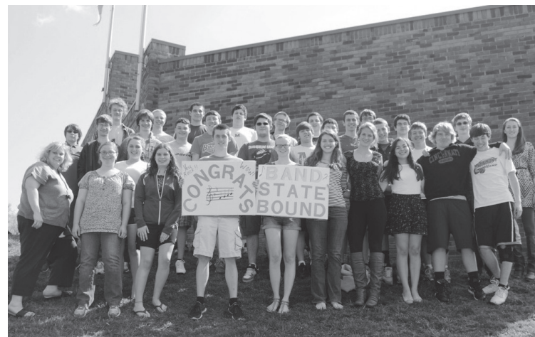
The members of the Mariemont High School Concert Band qualified with "Superior" ratings for the State Competition this spring.