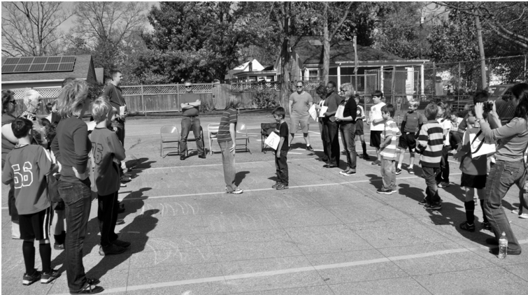
Mariemont City Schools students, parents and community members took part in one large chess match as they themselves were the board pieces.

Terrace Park Elementary into a giant chess board. Each participant represented an actual chess piece in a game of Human Chess.