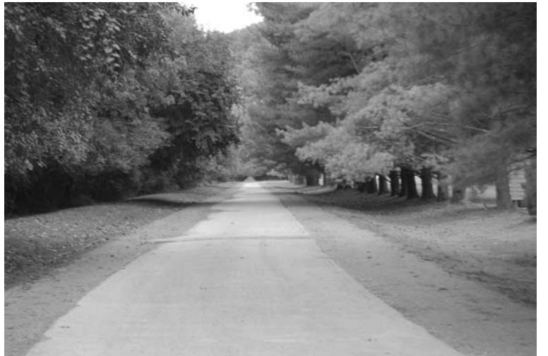
The newly widened back road at Drackett Field just before final tarring and chipping

The back road improvement project included removing the wooden posts, adding a total of nine feet of road to widen the existing road (some of which had been limestone gravel), and then tarring and chipping the surface. Under the leadership of Tiger Nelson and with the help of Sy Swart and the rest of the TPRC, bids were collected and evaluated and the final bid for the road improvement awarded to TowneScapes.