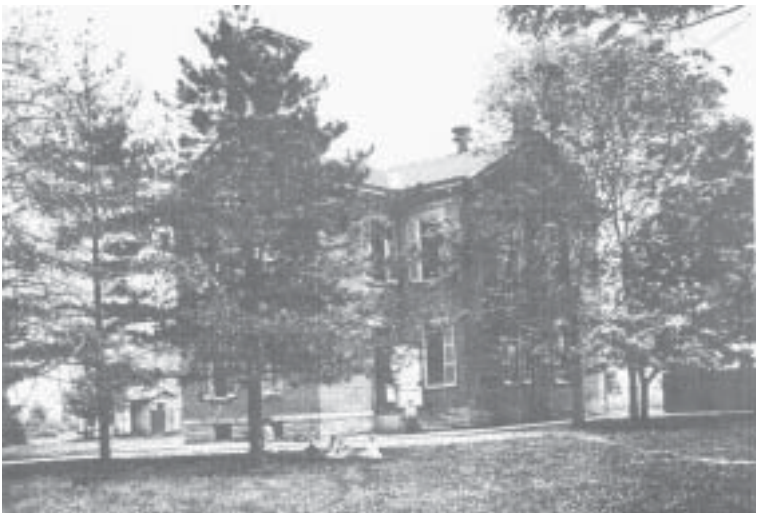
The 1872 school in front of the present school on Elm Avenue.

the money was spent on the classrooms so the gymnasium was not built. Evidently in those days if they didn't have the money they didn't build. When the school was completed and opened in 1913 the 1872 school was sold, probably for the bricks and lumber to be reused.