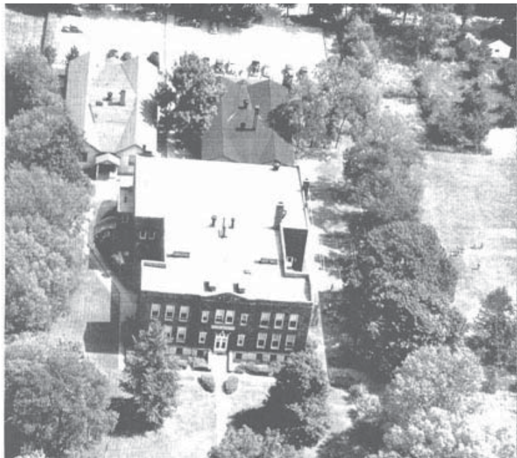
An aerial view of the 1913 school with the gymnasium addition and two Colony Buildings behind.

meetings could be held. In 1891 another room was added to accommodate the growing number of fee-paying students from nearby