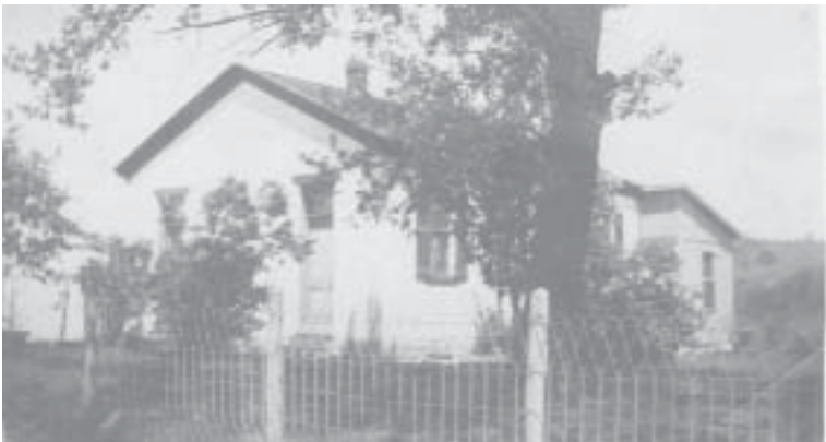
The 1853 school at the junction of Given and Indian Hill Roads.