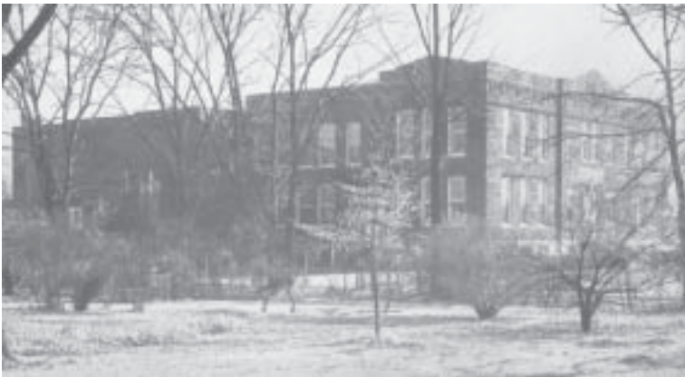
The 1913 school with the 1928 gymnasium addition taken from the side before the school owned the end lot.

The 1884 Moessinger and Bertsch Hamilton County map shows a school on Elm Avenue across the street from Gravelotte, in front of where the present school stands. It too was red brick and built in 1872. It had four rooms, two up and two down. The upstairs rooms could be made into one large room and was used for community and social gatherings. Later the building was jacked up and a basement dug where larger