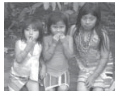
A 4 year old, 5 year old and 9 year old tsachila girl.

Technically, I am an agriculture volunteer, but Peace Corps volunteers always end up doing a wide