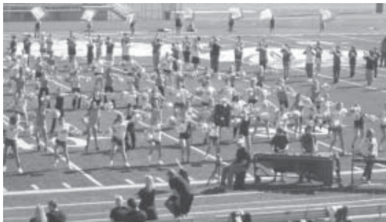
The Mariemont HS cheerleaders rehearse at Dolphin Stadium with dancers from across the country.