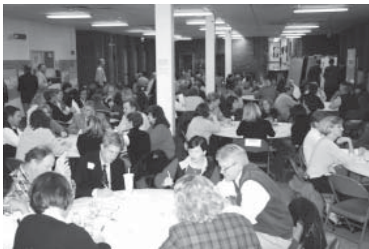
Nearly 150 community members participated in the first Mariemont Schools Facilities Community Dialogue in November. Facilities Community Dialogue II ñ Solution Options ñ will be held on March 25 at 7 p.m. at Mariemont High School.