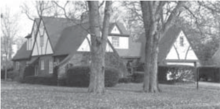
304 Amherst Avenue

1908. The Naylor's made several improvements to the house including painting it white, adding dark green shutters, putting a peaked structure over the front door and changing the windows to eight over eight panes instead of just two large top and bottom panes. While they were living there they attended a party after a play (probably Terrace Park Players) of probably 75 to 100 people at 304 Amherst Avenue. The house had a rathskeller in the basement with wall paintings by local painter Fred Williams and an old pocket billiards table from a billiards hall in Milford that was lowered into