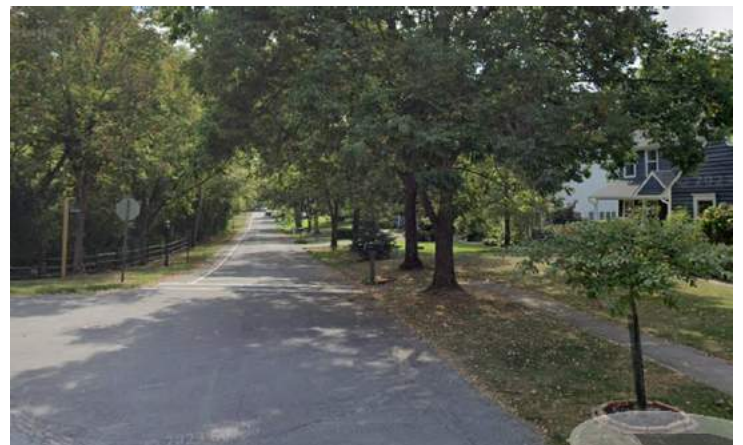
Currently Denison Lane