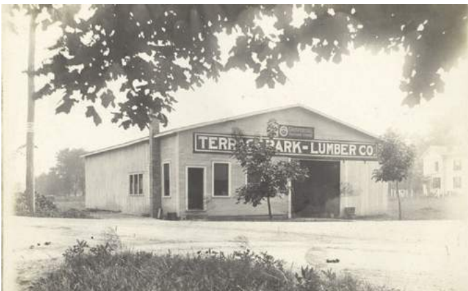
Terrace Park Lumber Company

The Terrace Park Lumber Company, established in 1914 by George Eveland, provided building materials and heating oil for the village until 1985, when it was replaced by a new development - Denison Avenue. A Village Views article from November 1985 gives a history of the Lumber Company (Visit tphistoricalsociety.org/about-terrace-park/publications to view the article).