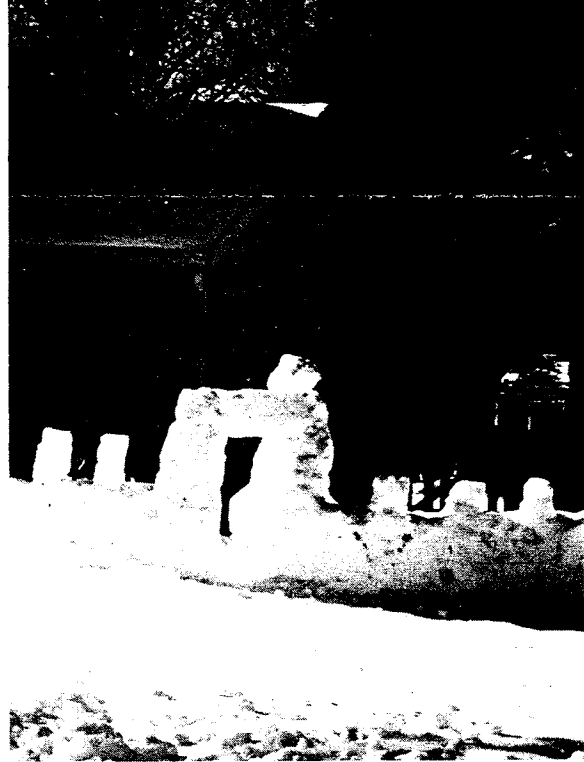
Quite a number of new families, such as the one shown above, have moved to Terrace Park recently. A search of village records could not locate a building permit for the edifice pictured here.