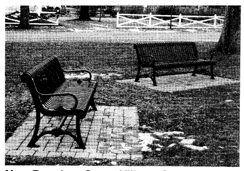
New Benches Grace Village Green

Bacon also reported several calls concerning dogs running at large and reminded residents of the village leash law.