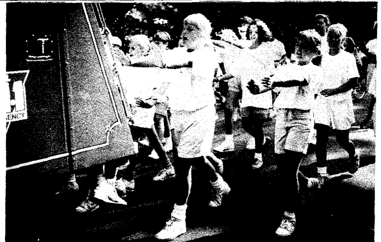
Terrace Park Girl Scouts were among the youth who marched in the parade. Some children decorated their bicycles and walked with their pets;

increase which they said resulted from the workings of new state legislation which had not been figured into the existing contract.