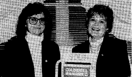
Coldwell Banker Serving Terrace Park

Call us for Professional Real Estate Advice. 248-1000