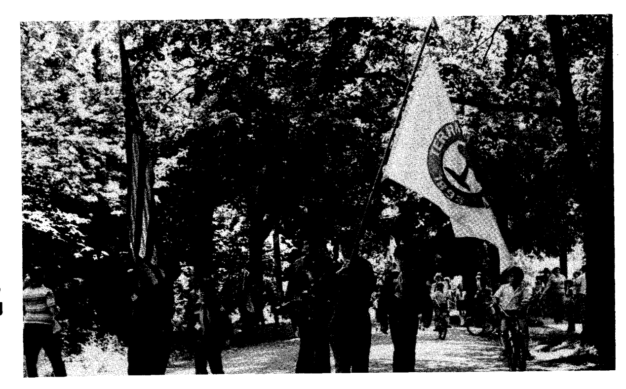
Cub Scouts Help Raise The Flag On The Village Green

Here Comes The Parade, With Cub Scouts Bearing Old Glory and the Official Village Flag