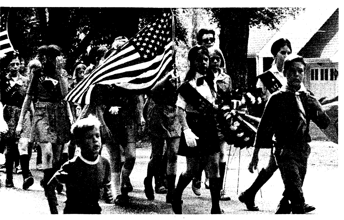
Memorial Day Parade, 1970, through Terrace Park streets to the Village Green. Boy Scouts and Girl Scouts are shown with their colors. Mariemont H.S. band and the Van Wye's Terrace Park band furnished marching music. The memorial wreath was presented by the Girl Scout Cadets.