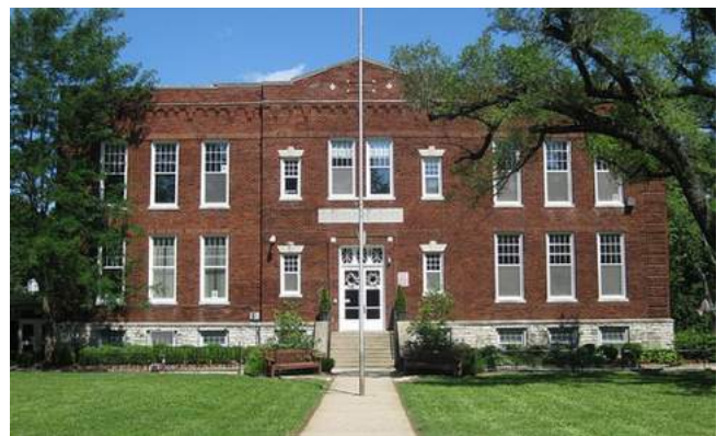
Terrace Park Elementary School 2023