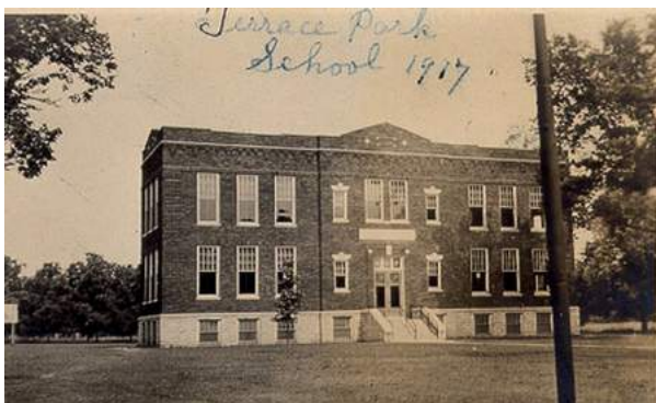
Terrace Park School in 1917