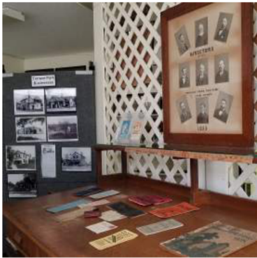
Terrace Park Businesses

The new museum is the result of much effort on the part of our board. Suzi Ricketts developed the original layout for the room and provided materials and design expertise. Laurie Baird created the red and white borders for the cabinets, and Sylvia Stirsman organized the collections, purchased the display panels and assembled most of the exhibits.