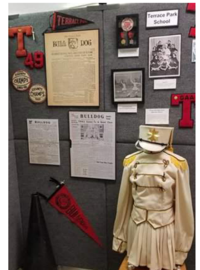
Terrace Park School Teams