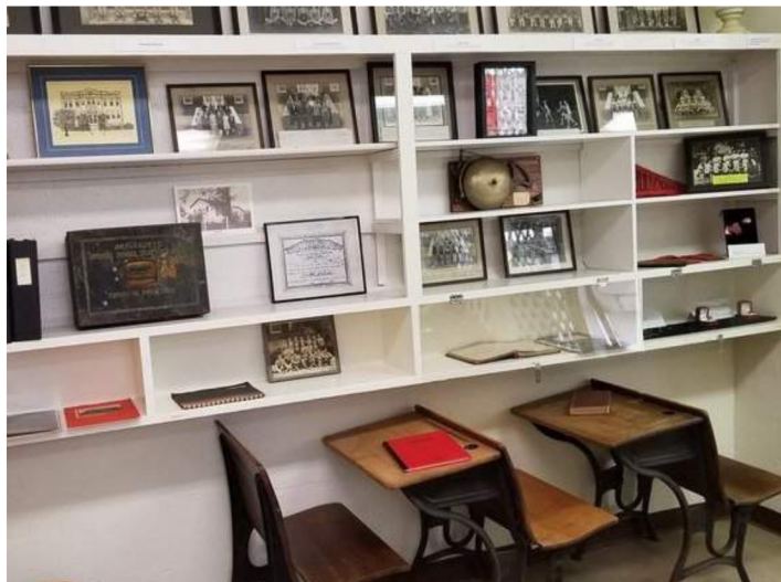
Terrace Park School Memorabilia