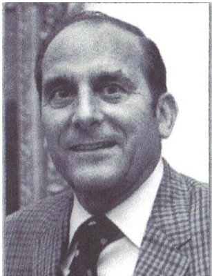
Lifetime member and long-time Terrace Park resident,