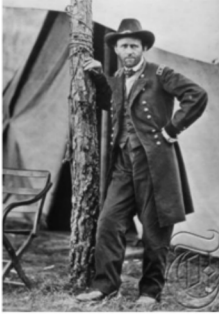
Grant the Soldier